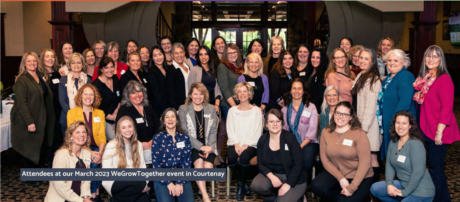
Attendees at our March 2023 WeGrowTogether event in Courtenay

we provided 16,488 services to women, compared to our target of 2,685